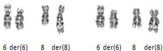
Figure 1: t(6;8)(p21.1;q24.2), G-banding. Courtesy H el ene Bruy ere.