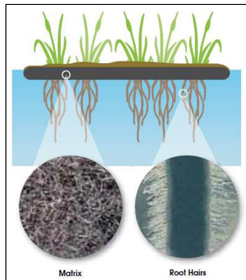
Figure 1 - Floating Wetland Schematic

Manufactured FWTS are supported by a floating medium, typically comprised of woven plastic, matting, or fibreglass, where plant roots grow directly into the water column, similar to a hydroponic system. As the plant roots grow through the floating medium and into the water below, they provide an extensive surface area for biofilm to grow on the root hairs (Figure 1). Biofilm coverage is an essential requirement for the sequestration of nutrients from stormwater (Borne et al., 2013; Winston et al., 2013), as it helps remove nutrients (particularly nitrogen) from the water through nitrification/denitrification processes, and is ultimately taken up by the macrophytes. Phosphorus can be retained through binding processes that occur within the biofilm (e.g. adsorption) and uptake of orthophosphates is achieved by vascular macrophyte species.