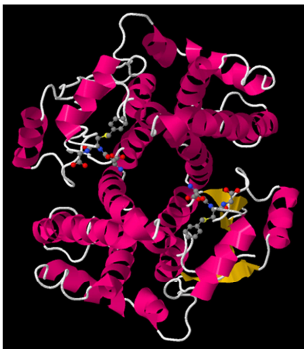
Structure determination and refinement of human alpha class glutathione transferase A1-1, and a comparison with the MU and PI class enzymes. Adapted from PDB (Sinning et al., 1993).