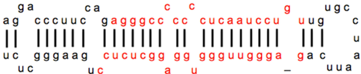
Stem-loop structure of miR-296, with mature miR-296-3p and miR-296-5p sequences highlighted in red.